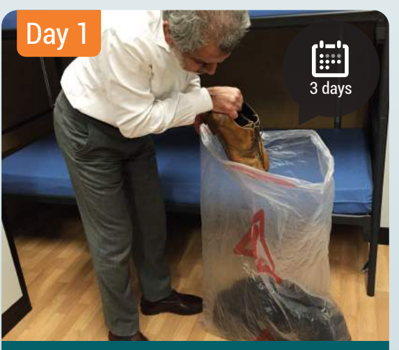
Put stuff you can't wash inside a plastic bag for 3 days. Like shoes, jackets and soft toys. The mites will be killed after 3 days! You can get a bag at the COA