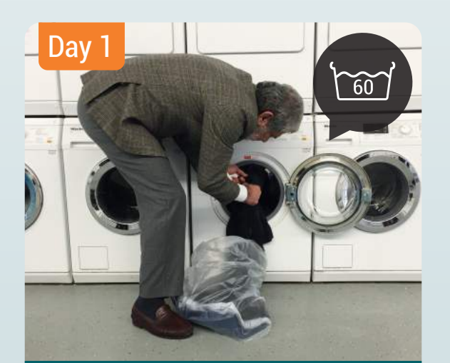
Wash your clothes at 60 degrees.