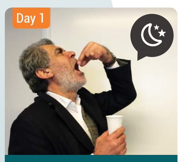
Take your tablets in the evening. Don't eat and drink 2 hours before and after you take them. Water allowed!