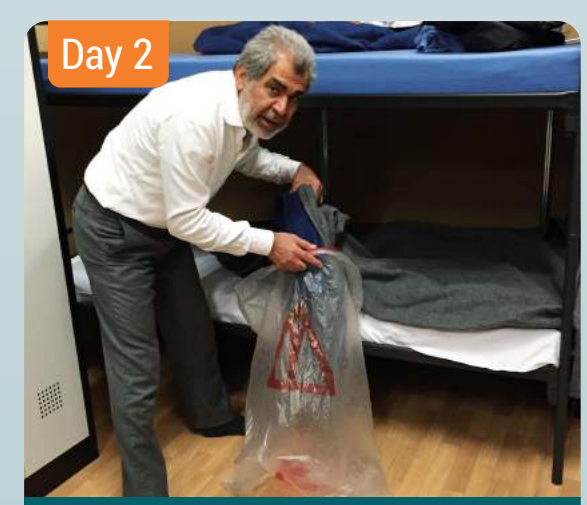
In the morning pull off all the bed sheets. Put them in a bag. Use new bed sheets.